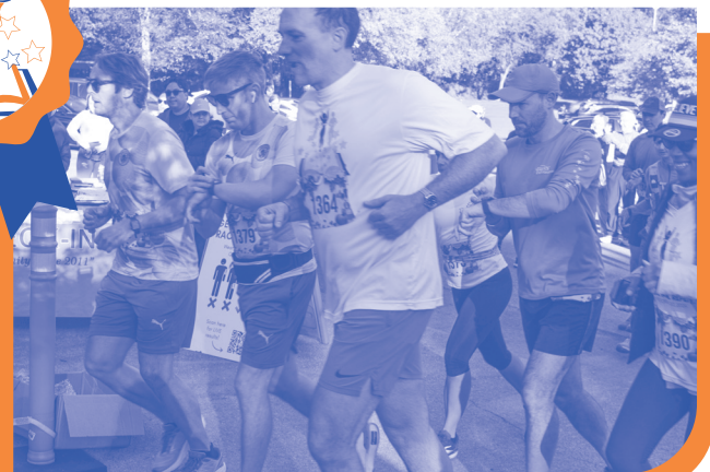
Participants at the starting line of our 2024 event.