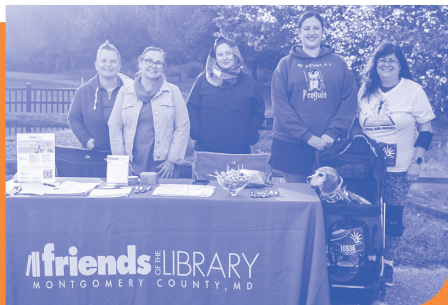
Members of FOLMC Staff and Board of Trustees at last year's event.

A 1-Mile Family Fun Run exclusively for our youngest library lovers. The 5K/10K event begins at 8:45 a.m., while the Family Fun Run starts at 8:30 a.m.