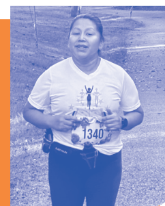
Register by Oct. 8 and you will receive an official Read.Run.Repeat. t-shirt!

Participating in Read.Run.Repeat. offers numerous benefits