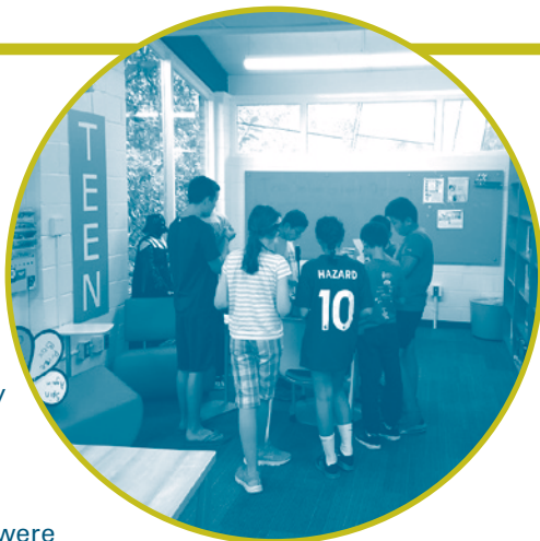
Updates to the library partially funded by FOL, Little Falls Chapter.

Visit the Friends of the Library, Little Falls Chapter website at www.folmc.org/little-falls-chapter/ or email LittleFalls@folmc.org today to find out how you can become involved.