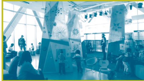
Early Literacy Center.

To learn more about the Silver Spring chapter and how to get involved email silverspring@folmc.org .