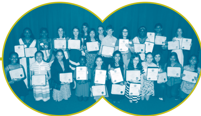
2016 Mosaic Winners and Honorable Mentions

For more information about Mosaic, visit http://www.folmc.org/events-calendar/mosaic/ .