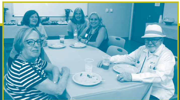
The volunteer appreciation celebration for the FOL Olney Chapter.

Several hundred volunteers are recognized each year throughout these appreciation activities that include refreshments for events, certificates of service and appreciation, and other mementos offered to thank volunteers for their hard work and support. MCPL and FOLMC together recognize the tremendous value volunteers bring to our libraries every day. These dedicated volunteers perform a variety of roles including creating and updating displays, updating bulletin board information, mending books, maintaining local book sale shelves, and beautifying the library grounds with gardening.