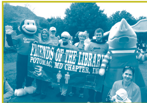
Potomac Chapter at the Potomac Day Parade.

The English Conversation Club has started up again after many requests by patrons, under the sponsorship of the chapter. The club meets at 11:00 am on Saturdays. No registration required.