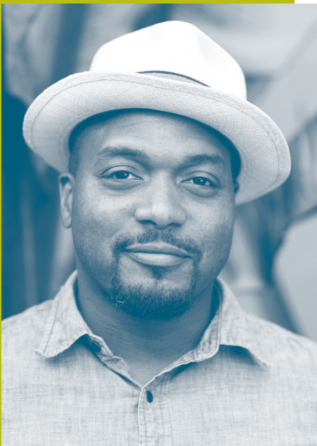
With author and James Beard award winner BRYANT TERRY

However – the cost of purchasing, outfitting and wrapping a van that will provide all that is needed was much more than the grant would cover. Most generously, the Friends of the Library, Montgomery County Inc. will be providing the additional funds needed to cover costs and make the Outreach Team mobile van a reality. As always, the FOLMC has stepped up to help MCPL with our mission to serve of our community. So, thanks to the FOLMC Board, and to all of the members who work so hard to support our library, you will see a fantastic library van tooling around the county in the next year.